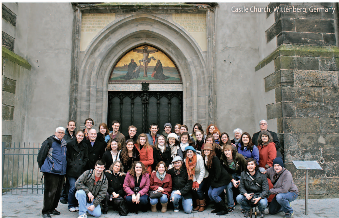
Castle Church, Wittenberg, Germany