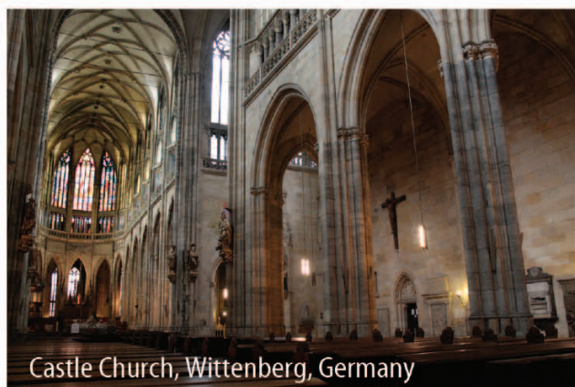
Castle Church, Wittenberg, Germany